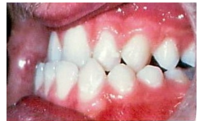
Fig 1: Notice mandibular incisors are tipped lingually in Class III patients.

In skeletal Class III relationships, the mandibular incisors are usually tipped lingually to help offset the existing skeletal imbalance. ( Fig 1) The teeth often continue to move in this manner as skeletal relationships become more severe with unfavorable growth and development.