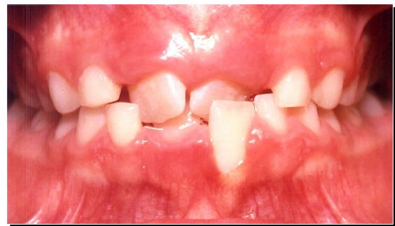
Fig 2: Notice recession of mandibular incisor due to anterior crossbite. Decompensating this will automatically improve the health of the gingiva.

Long-Term analysis also includes consideration of third molars, additional growth and development, limited retention vs. permanent retention and continued functional problems. These factors often affect the long-term stability of orthodontic treatment.