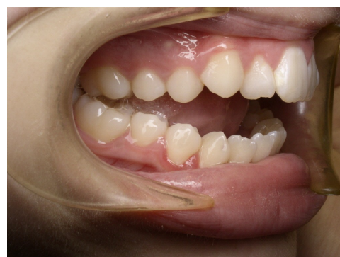
Fig 3: Note the lower incisors are tipped labially in Class II patients to compensate for the malocclusion.